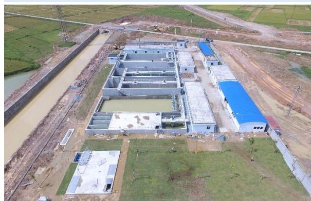
STP – under construction