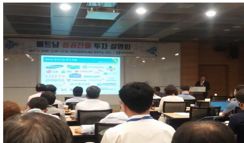
Seminar: “Keys to Successful Investment in Vietnam” in Korea in June ‘17