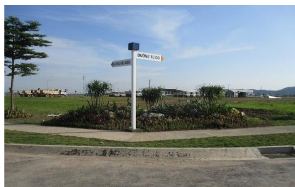
Main Road - completed