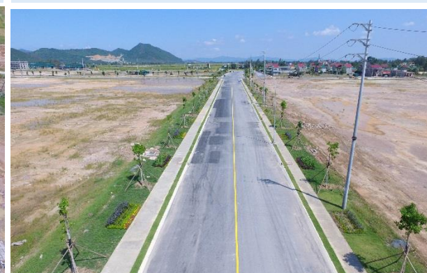
Power, Water & Drainage - ongoing