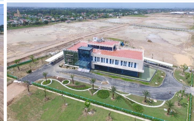
Office – put in operation in Oct '17