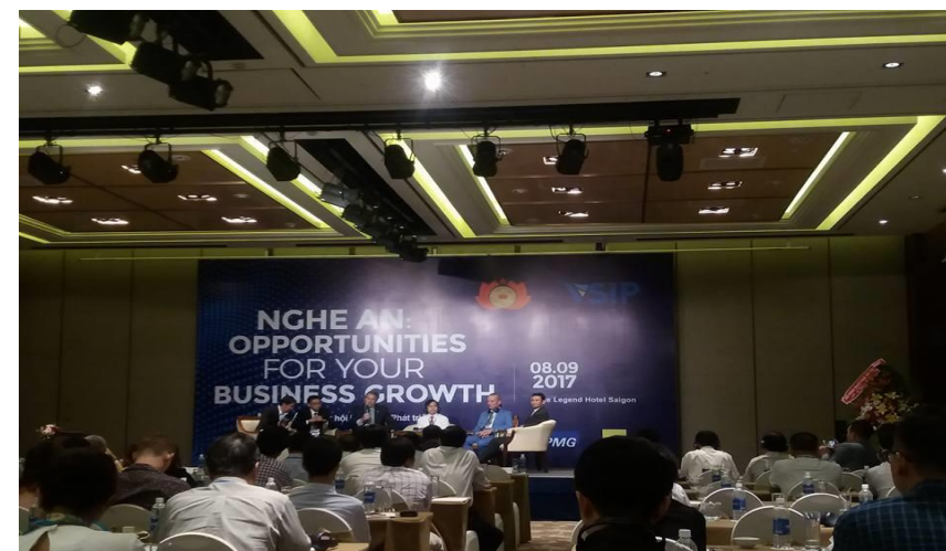
Seminar: “Nghe An: Opportunities for Business Growth” in HCMC in September ‘17