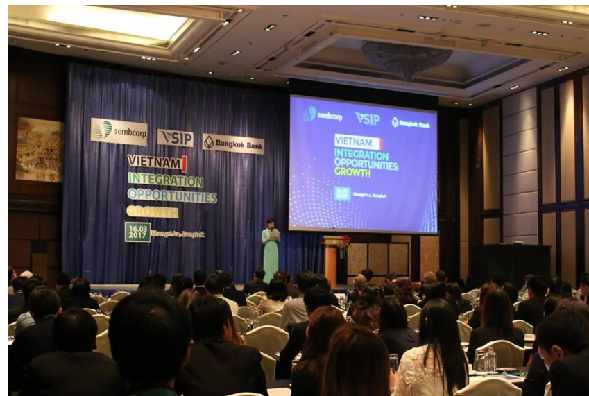
Seminar: “Vietnam: Integration – Opportunities – Growth” in Thailand in March ‘17