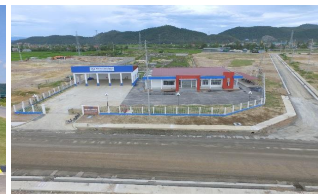
Firefighting station - competed