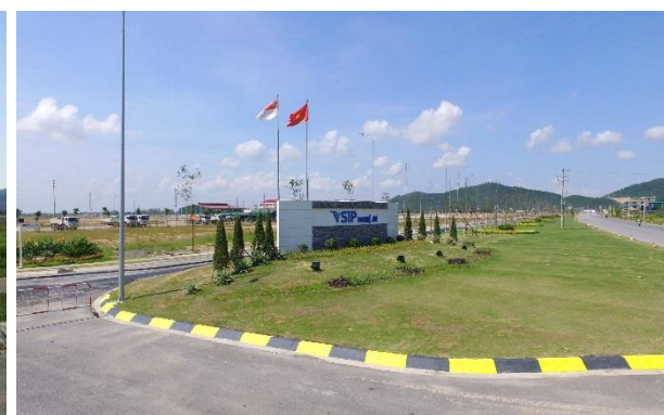
Landscape - ongoing