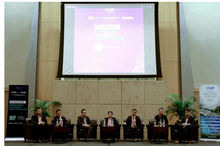
Seminar: “Vietnam: Opportunities for FDI” in Malaysia in March ‘17